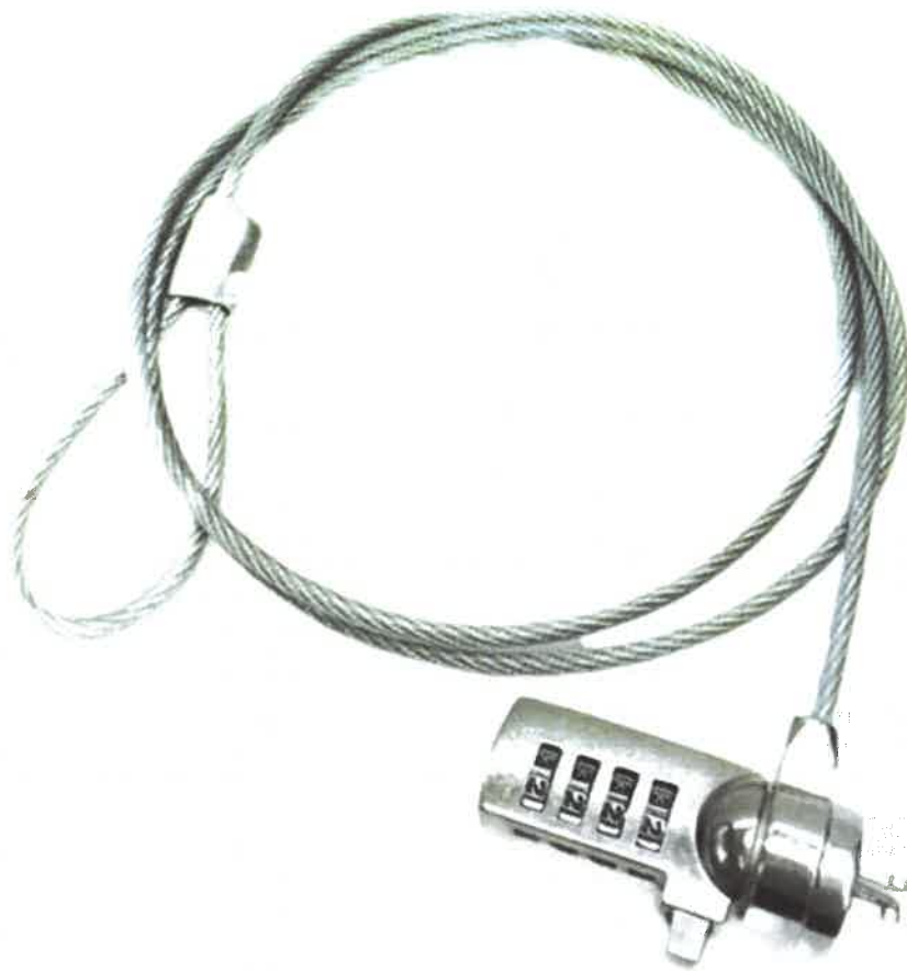
Password Anti-Theft Lock Internet Cafe Computer Lock Universal Laptop Computer Lock