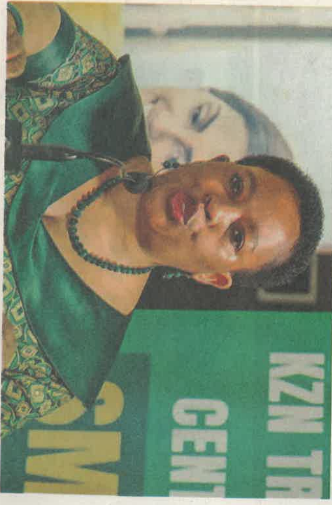
KZN premier Nomusa Dube-Ncube speaks about youth support.

The departments are looking into re-prioritising within their baseline budgets to spend where it matters the most in the fight against crime and to drive mass employment.