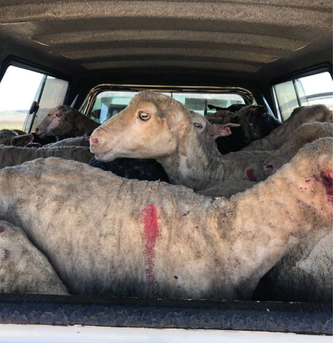
Police find stolen stock.

EFFORTS to combat stock theft in OR Tambo are in full swing following the recent discovery of 16 goats valued at R3 200 in Qumbu, Eastern Cape, among others. SAPS Qumbu Stock Theft Unit conducted their daily operations at the Sangqu locality recently and came across three men on horseback, herding 16 goats. However, the suspects fled the scene when they saw the police. In another incident, Tsolo Stock Theft and Endangered Species Unit members conducted a stock raid in Qebeyi and recovered seven cattle valued at R70 000. The cattle were impounded at Tsolo Municipality stock pound. Then in the Qanda location, 11 cattle valued at R110 000 were also impounded after being found straying.