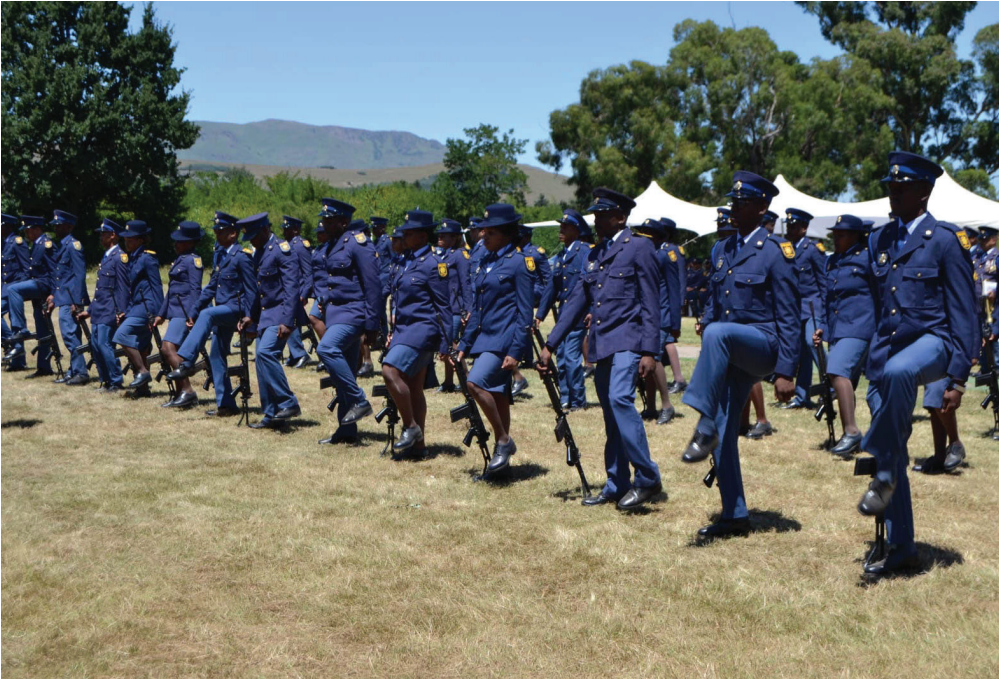
SAPS hosts crime prevention Imbizo.